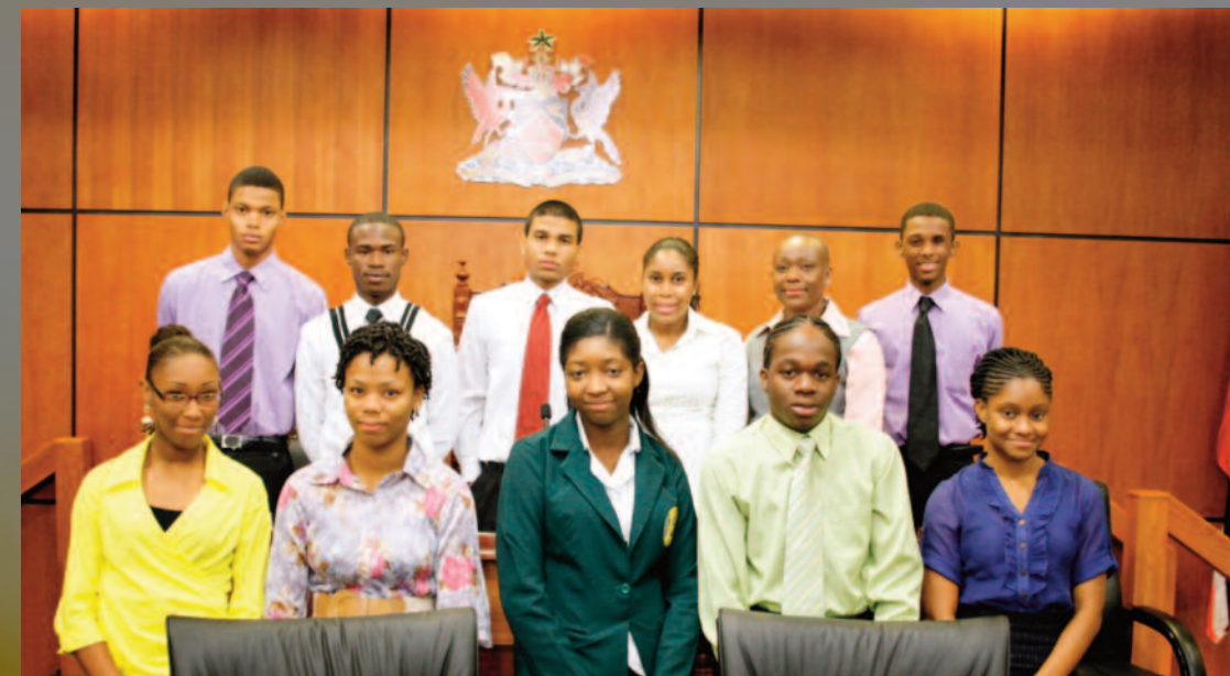
First-time Parliament experience for our young interns